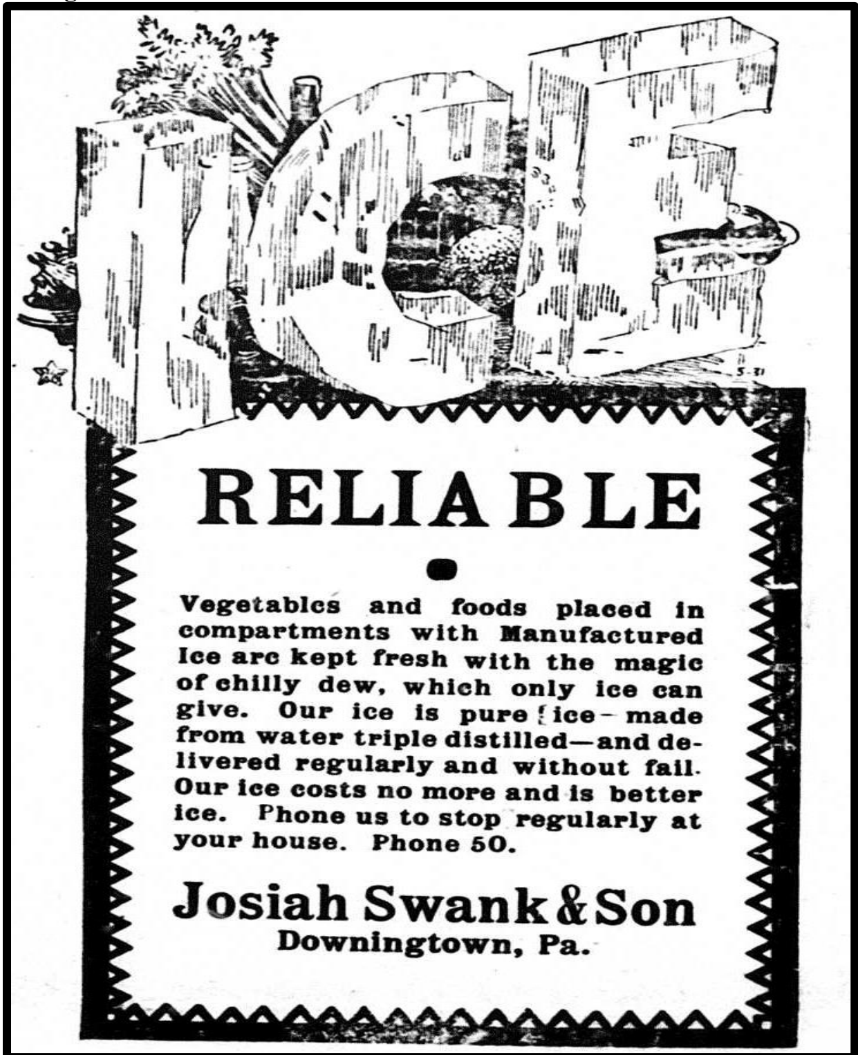
This ad was originally published in the August 21, 1931 edition of the Downingtown Archive .